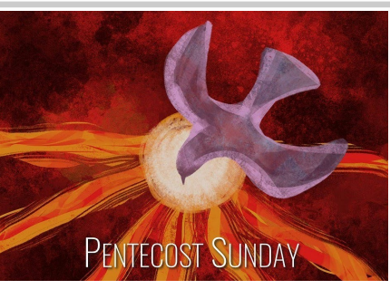
Solemnity of Pentecost. Sun. 23 May 2021

Ascension of Our Lord. Sun. 16 May 2021.